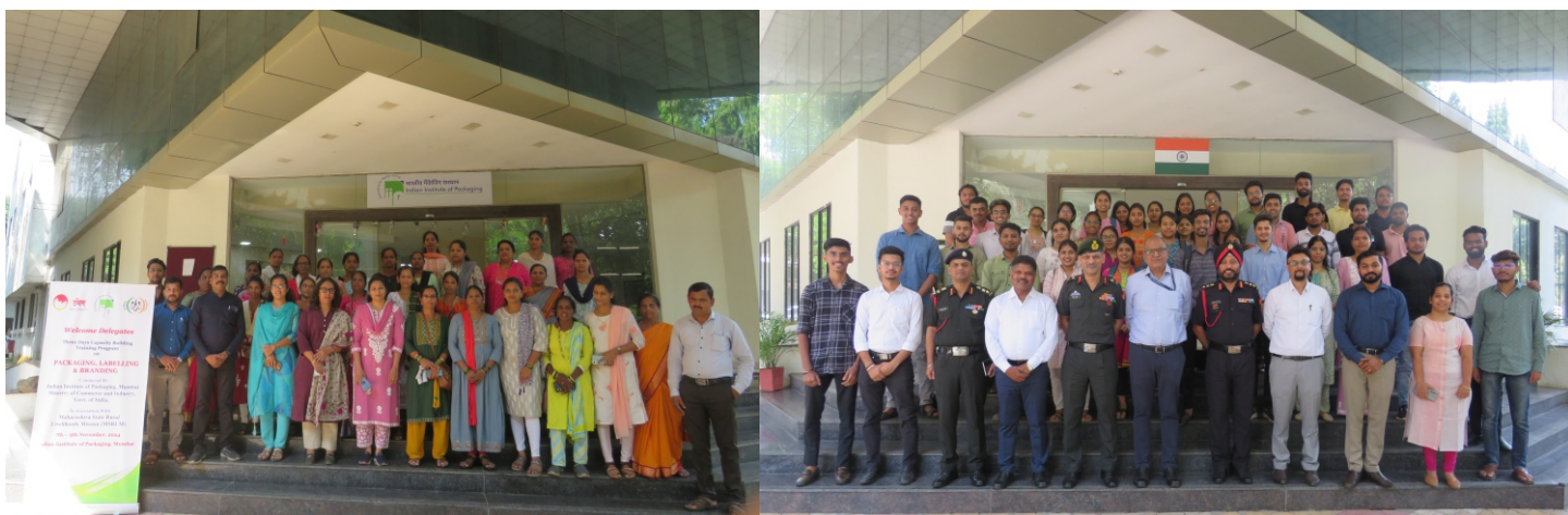
Residential Training Programme

Residential Training Programmes – The Institute conducts Residential Training Programmes at its Campus in Mumbai. These programmes are designed to meet the specific requirements of the organisation / industry.