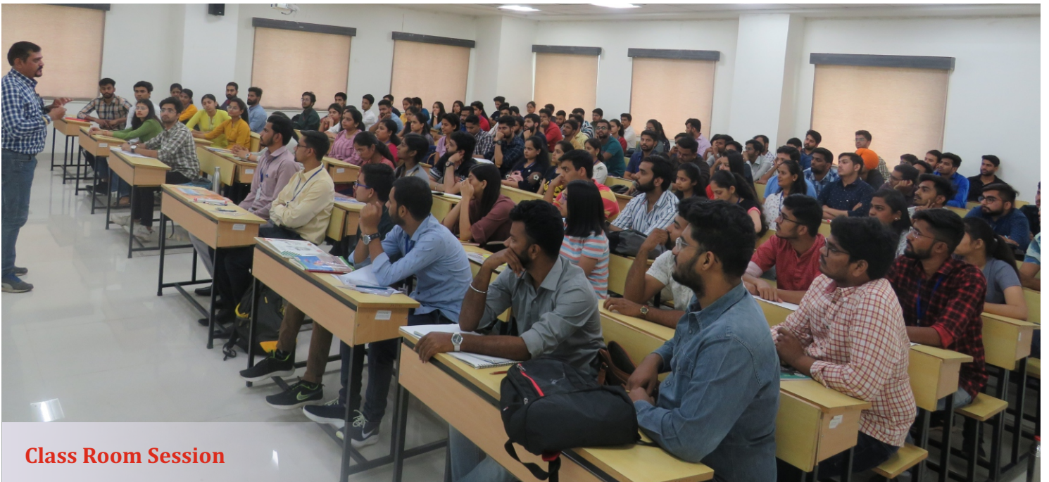
Class Room Session