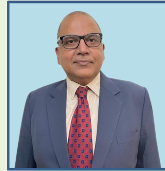
Desk of Director

Indian Institute of Packaging (IIP) is an autonomous body in the field of packaging and working under the administrative control of the Ministry of Commerce and Industry, Government of India. The Institute was established on 14 th May, 1966 with its headquarter and principal laboratories at Mumbai. The Institute has set up its first branch office at Chennai in 1971, followed by Kolkata, Delhi, Hyderabad, Ahmedabad and Visakhapatnam in 1976, 1986, 2006, 2017 and 2021 respectively. In addition, two more Centres are to be made operational at Bengaluru and Guwahati.