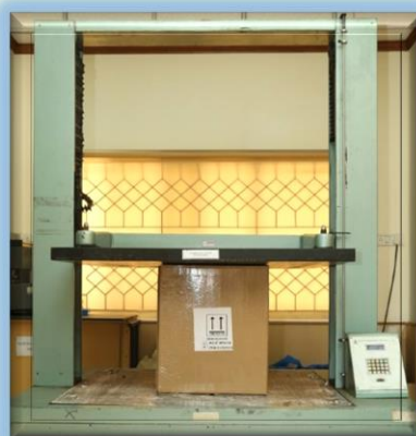
Box Compression Tester