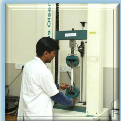
Universal Testing Machine