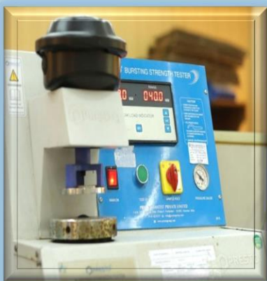
Bursting Strength Tester