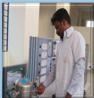
Hydraulic Pressure Tester