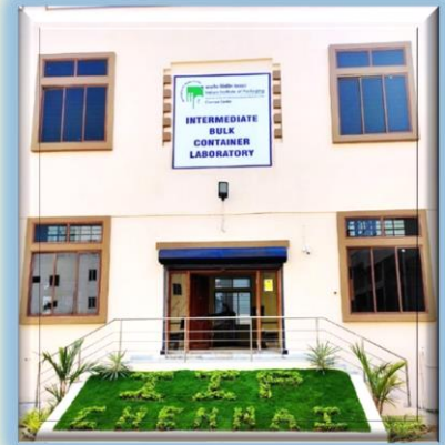
FIBC Testing laboratory