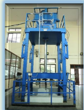
Top lift Tester