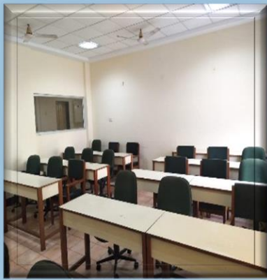
Classroom facility at IIP Chennai

The Institute is well equipped with state-of-art package testing Laboratory, fitted with multimedia projector Air-conditioned Classrooms.