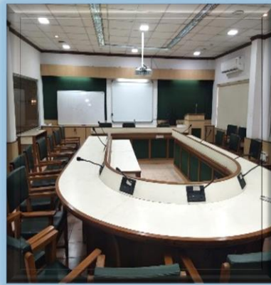
Conference Hall - IIP Chennai