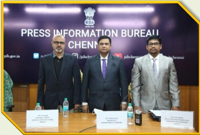
Press meet of the Launch of CPE Course